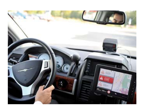
The latest results of the European research on cooperative systems were demonstrated outside the exhibition hall by the EU project CVIS, Safespot and Coopers. Many different companies are participating in the project.